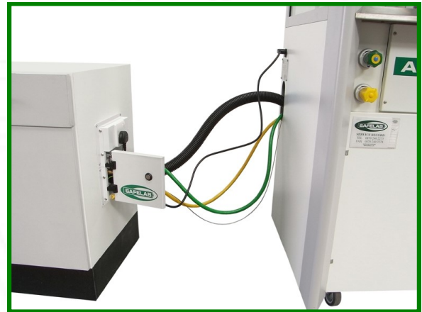
Standard docking station on LHS of fume cupboard