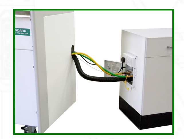
Docking station with RJ45 option on RHS of fume cupboard

Quick release connections to water, waste and gas