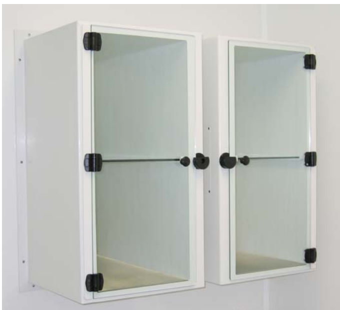
“IN” AND “OUT” PASS THROUGH HATCHES INSTALLED IN A CLEAN ROOM WALL

Our capabilities, whether in technology, design, safety of operation, construction or service are also fully at your disposal”.