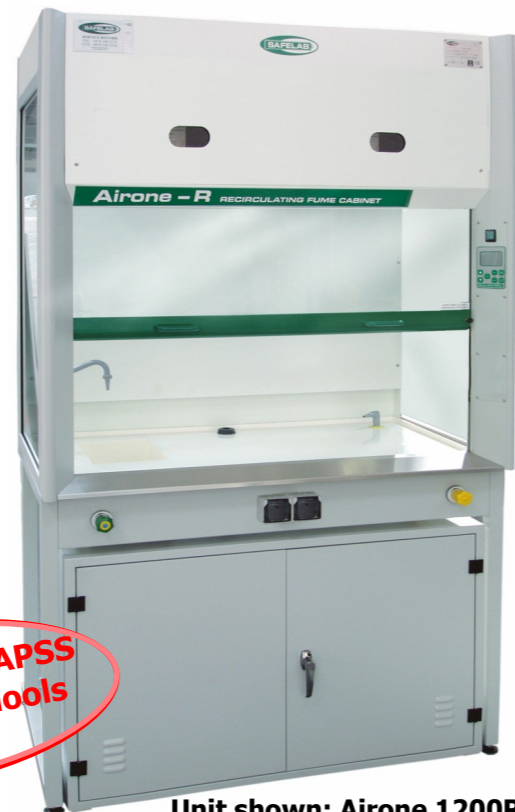
Unit shown: Airone 1200R with optional storage cabinet